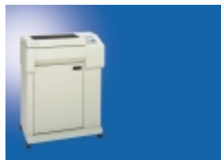
T6050 Enclosed Pedestal