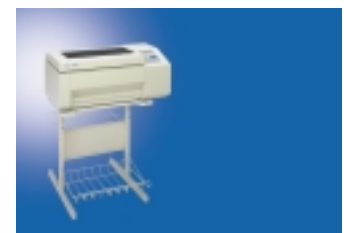
T6050 with Pedestal