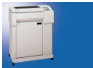
T6100 Enclosed Pedestal