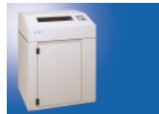
T6101 Quietized Cabinet