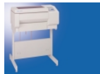
T6100 Open Pedestal